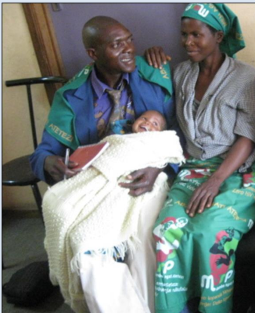
Pic 1 to the left:

Traditional leaders from the targeted Traditional Authorities mobilized 35,311 communities in their respective villages through community dialogues, awareness meetings trainings, and workshops to modify cultural practices which included: “wife exchange” (where men were exchanging their wives without the concerts of their wives. After the realization of men on sexual reproductive health rights of women and girls, they have stopped wife exchanging), “Early and forced marriages for young girls” . Under this, traditional leaders reinforced customary laws where any parent or guardian forcing their young girl child getting married to older men, the family is punished and the new family abolished by traditional leaders. This has become possible with support from customary laws set by traditional leaders in conjunction with community members. “Death cleansing” a man was being hired to do sexual cleansing with a woman of the deceased man by doing sex intercourse with her for several days without using condoms currently they are using herbs instead of forcing the widow to have unprotected sexual intercourse with the hired man.