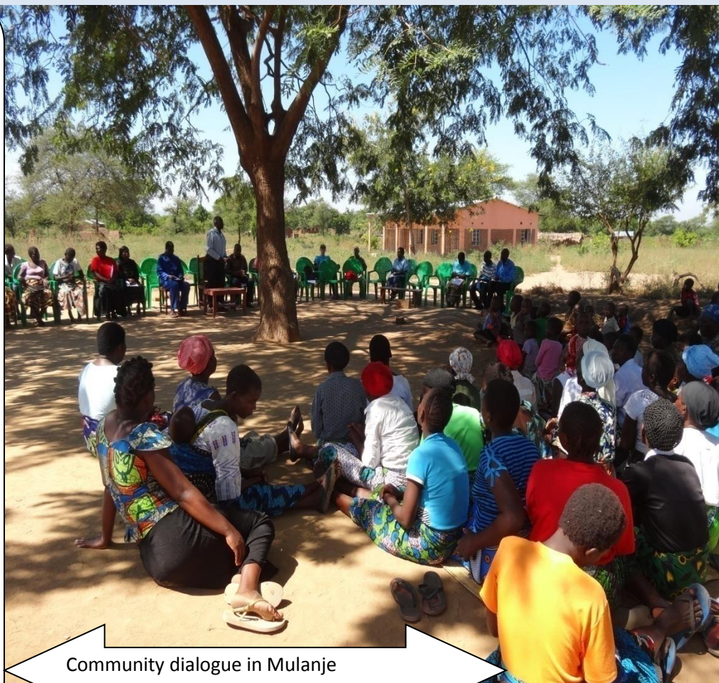
Community dialogue in Mulanje

In 2017 to 2018, CHICOSUDO empowered 180 traditional leaders and 220 community based volunteers who mobilized 8,311 communities to support the modification of harmful cultural and religious norms that promoted violence against women and girls including early and forced marriages, raise the voices of women and girls, advocate for access to legal and sexual reproductive health services.