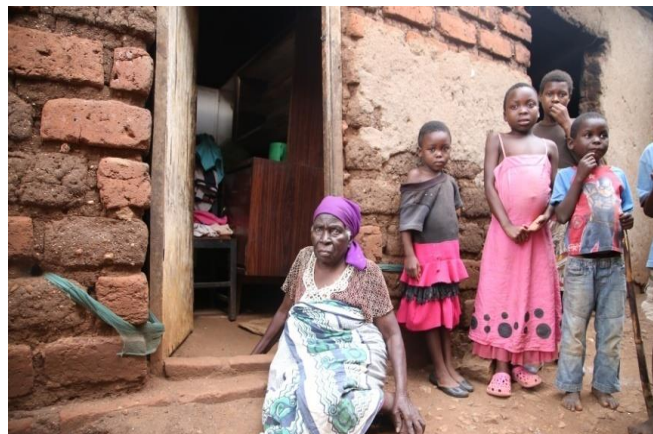
Demonstration of poverty levels at Munyere Village.

main Center was at Ken Office while two were satellite. CHICOSUDO partnered with Fountain of Hope and Tiwasamale CBO .