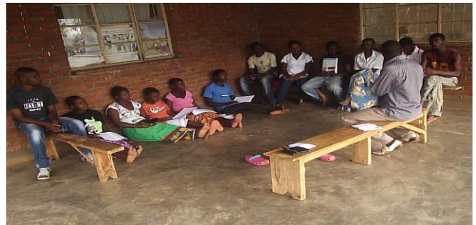
Sensitizing the youth on sexual reproductive health rights

Consultations made with children, their families and traditional leadership revealed that about 50% of girls who sought of child marriage as a solution to their problems are changing their attitude. The way girls look at marriage has now changed. Previously,