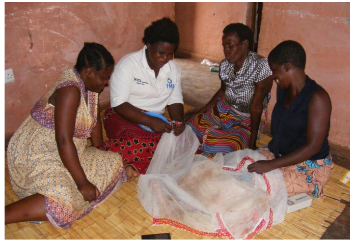
Embroidery Training in progress at Goman Village.

Actual Training: Three months training course of stitching, computing for the beneficiaries as per their interest and feasibility.