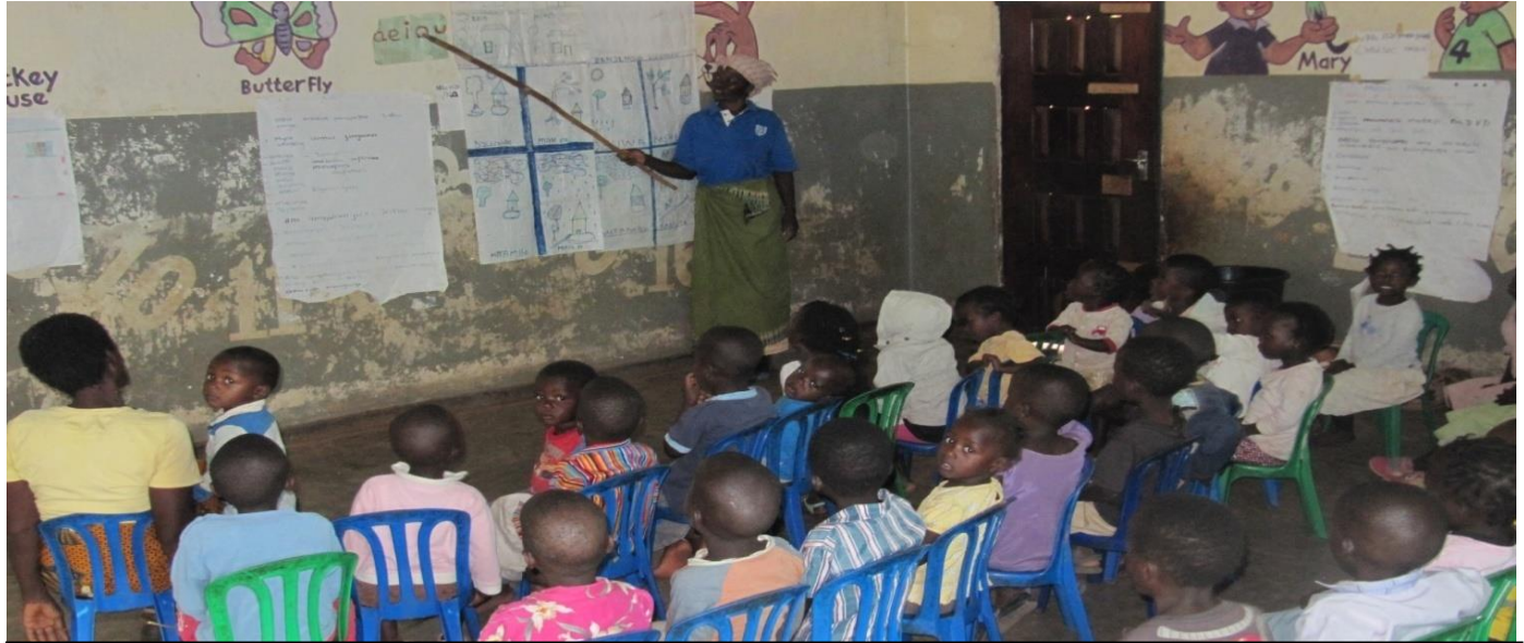
Caregiver providing early education at Chitani Community Based Child Care Center in Blantyre .