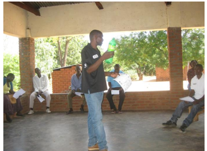
Awareness campaign at Manes Kapeni in Blantyre and Ntonya village in Mulanje.