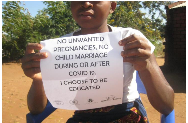
Youth Clubs at Maluwa Village in Blantyre