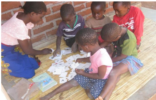
Caregivers at Maluwa Village providing basic education to children.

Schools in Malawi remain closed. No date has yet been suggested for reopening. CHICOSUDO is working with communities to promote basic education of children of