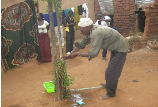
Elderly testing hand washing in Mulanje

of soap and Hand Washing pails. So far we have reached a total of 6,587 people with WASH-related messages. Of these, about 2,744 are children under 18 years, and a total of 3,843 are adults. The approaches include the use of hand washing demonstration at household level.