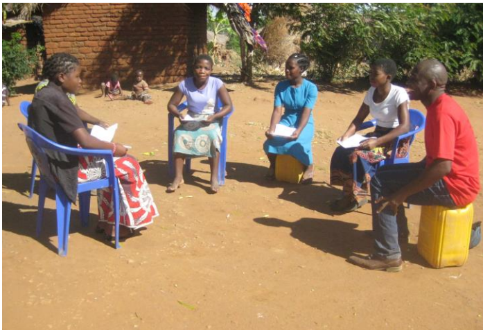
Disseminating COVID 19 prevention messages at GVH Manes Kapeni, Blantyre.

CHICOSUDO continues to advocate for child protection and gender-based violence (GBV) prevention by working with community structures including traditional leaders, faith leaders and clan heads. Our focus is to ensure that adolescence girls are free from early marriages. To ensure that adolescence girls are protected from early pregnancy, we are providing sexual reproductive health information through door to door approach. So far 15 clubs have been established composed of 8 to 12 members in Blantyre rural and Mulanje.