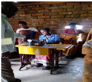
Trainings are in progress at Ntonya CBO center.

CHICOSUDO works with training institution for accreditation of learners. Therefore CHICOSUDO will work with both, government and private institutions. At the completion of the course, certificates will be disbursed to the beneficiaries.