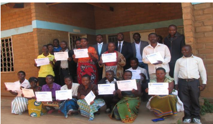
Paralegal trainees showing their certificates after training.

The area had two paralegals who apart from serving GVH Ntonya, they also provide services to over 5 GVH's. In this case, there was need of adding more paralegals who would be concentrating in GVH Ntonya only, if ending child marriage is to be achieved in the area. Therefore, the gap was addressed through this project.