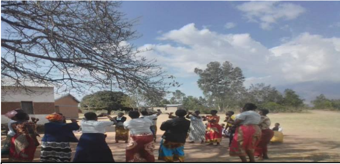
Village sensitization meeting – Mwanakhu Village